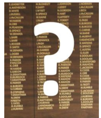
2016 - ?