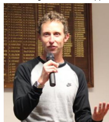
2013 - Hamish Carter